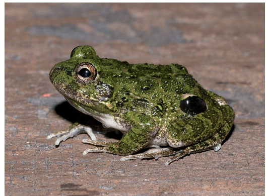
Figure 1. Male of Pleurodema bibroni from Valentines, Departamento de Treinta y Tres, Uruguay.

Uruguay, Departamento de Canelones, Balneario Jaureguiberry, 34.77° S; 55.41° W; altitude 5 m a.s.l.; MNHN 9455: Many males were calling at night on 20